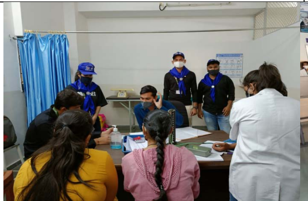
JNHMC Hospital and NSS Members